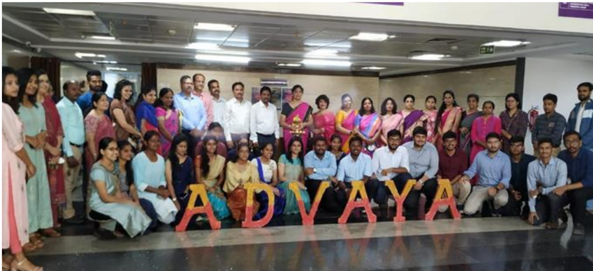
Cultural trophy was won by-“YUYUTSA BATCH 2019”

Off stage events which included poetry, quiz, debate, short comics, creative writing, sketching, doodling, painting, word scramble, fun events like stand-up comedy, improve act, dumb charades, mehendi, antakshari, cooking without fire, hogathon were witnessed from 13 th to 22 nd . Students participated actively and bagged lot of prizes.